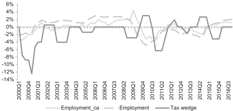
Figure 1. Annual changes in employment, cyclically adjusted employment and tax wedge.