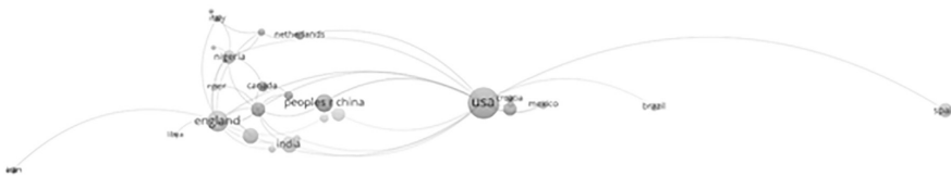
Figure 3. The most productive countries

Figure 3 shows the most productive countries in terms of the number of publications included in the study. The authors of the papers studied come from 56 countries. The most productive country is the United States of America (USA) with 32 published papers, followed by England with 14 published papers and the Republic of China with 11 published papers. Other countries that are the subject of this study have less than 10 publications.