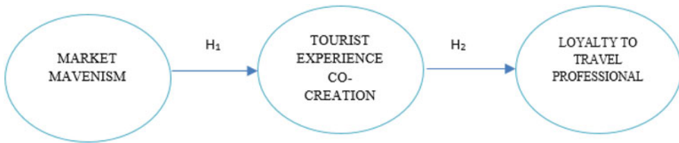
Figure 1. The conceptual model of this study.